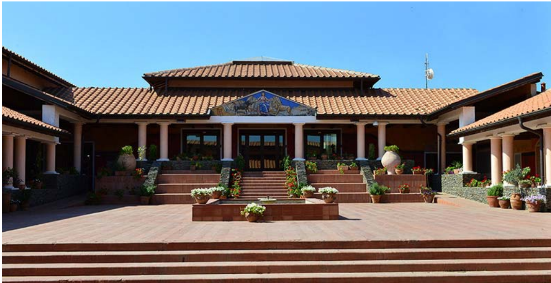
Viminacium, Scientific, Research and Visitors' Center

At Viminacium, you can be either accommodated at the Limes Park, which is a part of the Archaeological Park or at private hotels and guest houses in the vicinity of Srebrno Jezero and Požarevac, with a shuttle service from and to the conference venue provided. Those who are going to be accommodated at Srebrno Jezero or Požarevac are requested to inform the Limes organizers about it because of the organization of the shuttles to and from Viminacium.