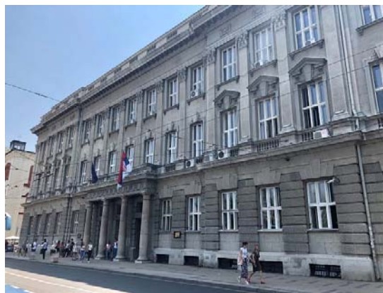
Faculty of Philology