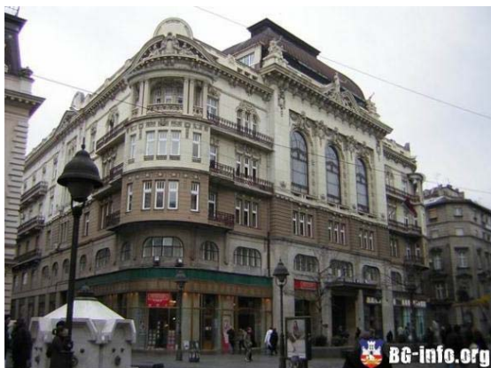
Serbian Academy of Sciences and Arts