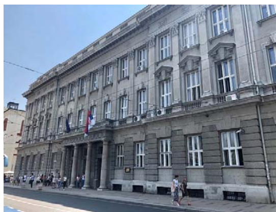
Faculty of Philology