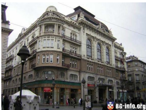
Serbian Academy of Sciences and Arts